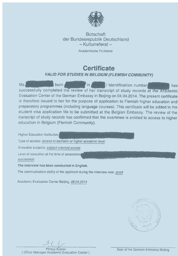
(example of an APS certificate valid for studies in Belgium)

PLEASE NOTE: this procedure is not applicable for students coming from Taiwan!